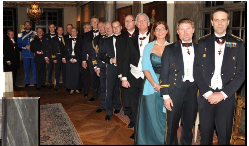
Two Grand Priors, two Commanders, thirteen Knights and one Grand Secretary General (behind the camera).