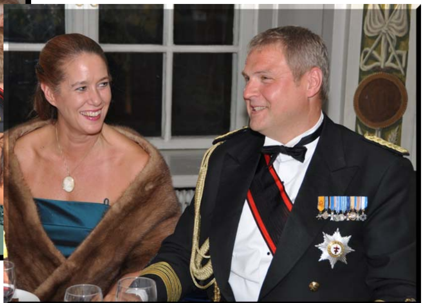
Grand Prior Estonia after his speech.