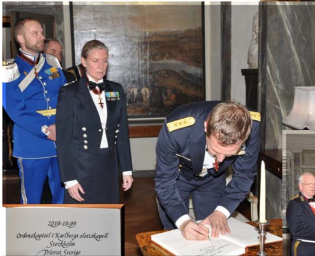
The final formal act... signing the Order Ledger.