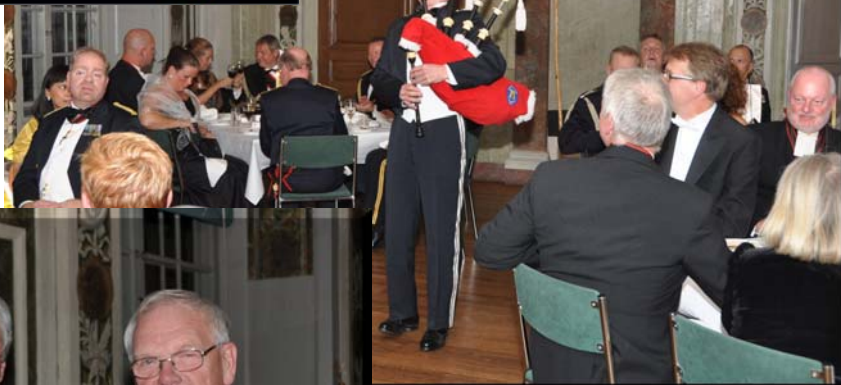
Grand Prior of Scotland was invited and preparations were made to make him feel welcome (sadly he couldn't make it...).