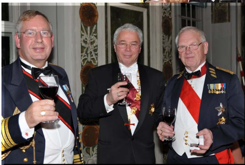
The three Priors...

Non nobis, Domine, non nobis, sed nomini Tuo da gloriam