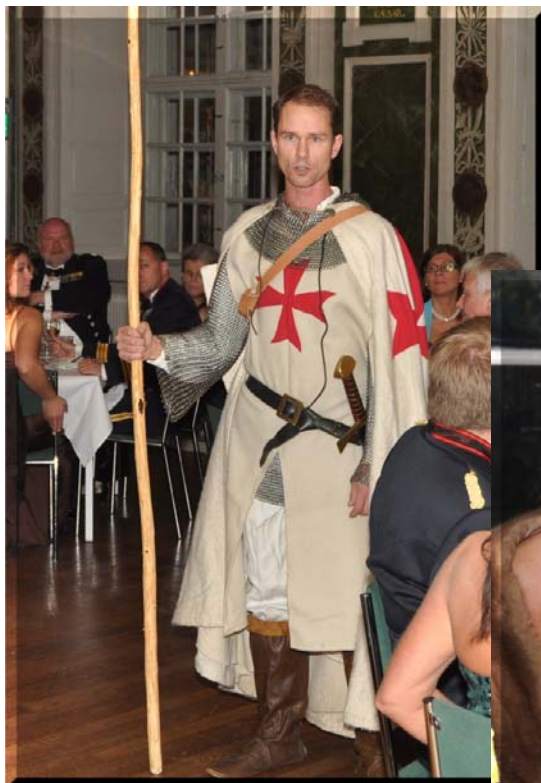
A Knights Templar (in real outfit) reminded us that we are not only a pious Order, but when necessary even exercising the right to defend the weak, oppressed and misfortunate ...regardless of ethnicity and/or religion.