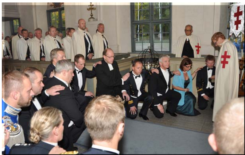
Thirteen, worldly Knights longed for our Temple's fellowship, water and bread.