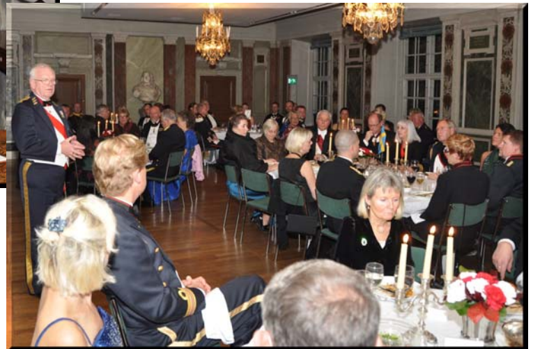
Gala Dinner with speeches...