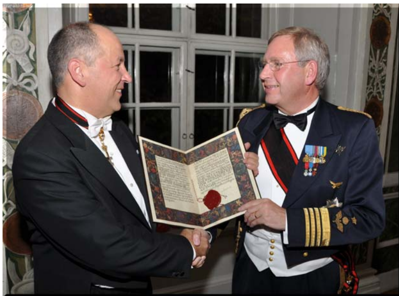
The envoy for Hungary delivers Grand Priory of Hungary's greetings and token of friendship to all Knights Templars in Scandinavia.