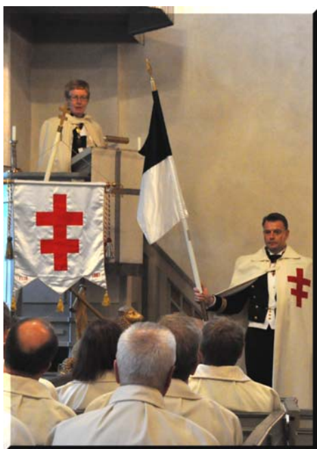
The word of our Lord, delivered by our chaplain. In short: Who are you and what do you do when your mantle is in the wardrobe? (One of the best sermons I ever attended).